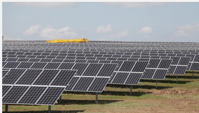
Figure 2: Burnoye-1 Solar Power Plant in the Zhambyl region, south Kazakhstan

Financing: Co-financed by the European Bank for Reconstruction and Development (EBRD) and other multilateral development banks